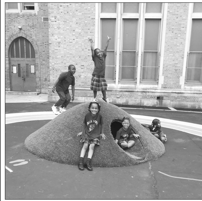
Students at Emlen Elementary School on the new playground

PHILADELPHIA - On Thursday, September 13, leaders from the Eleanor C. Emlen Elementary School and the Lindy Family Charity Foundation will be joined by City coun-